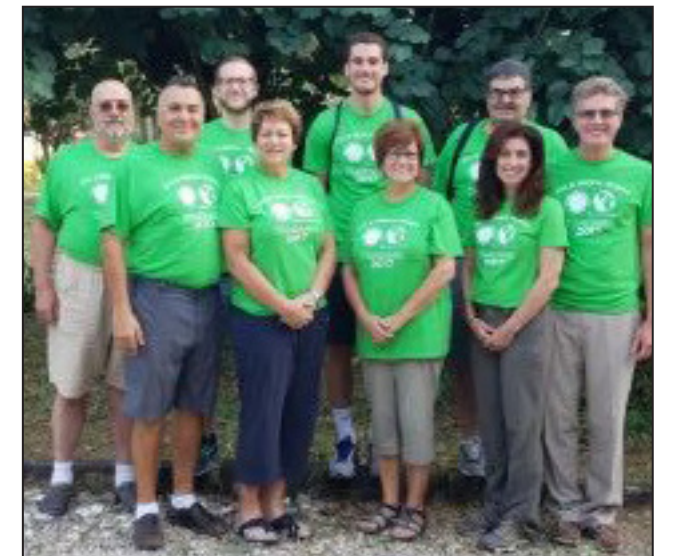
This was our team picture from Tanzania. We try to get a team photo from every mission, wearing our t-shirts. The color of the shirts changes and some of the faces change slightly, but we’re blessed with so many wonderful and giving volunteers.