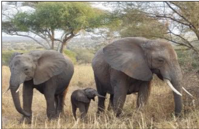
We often feature photos of our teams and the patients we serve, but the wildlife we saw during our brief Safari in Tanzania, was unique and breath-taking!