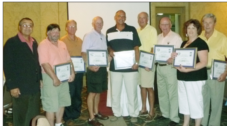
All members of the golf tournament committee, who have supported WBO for 20 years, were recognized for their service at dinner following the golf outing last year.

The Tournament Committee has begun the planning process for what we hope will be another successful and fun-filled event this year. Please mark your calendar for Monday, August 29. We hope you can be part of this important event to support WBO!