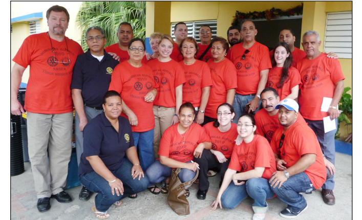
This photo includes the WBO team members and some of our wonderful host from the Dominican Republic. It is the collective work of these volunteer that keeps us coming back and enables us to maximize our efforts to bring light into the darkness for many.

We had assembled a team, made airline arrangements and were prepared to begin packing when news reached us that increased violence had erupted in Egypt. The team had been