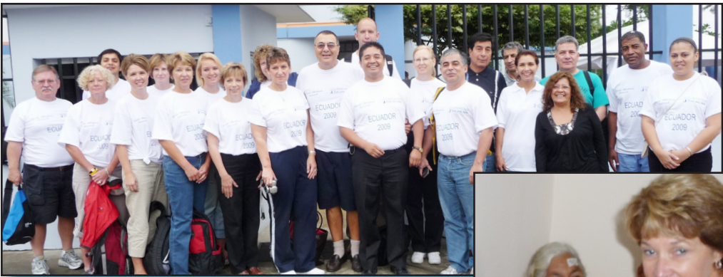
Pictured at left are team members who traveled to Ecuador. The team coordinated a very productive and successful mission.