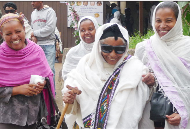
The faces of these ladies speak volumes for the work performed by WBO teams - they are all smiles because of their mother's ability to see clearly.

The mission was a huge success, both in terms of the number of people we helped, but also the breadth of services that we were able to provide.