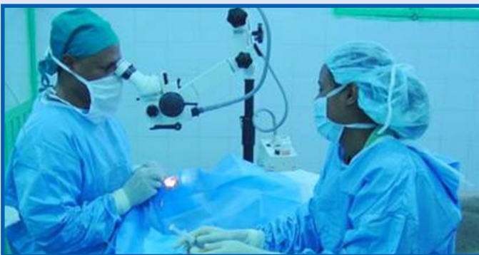
Kenya - Kenyan doctor performing cataract surgery working with World Blindness Outreach doctors.

Ecuador - This WBO team from 2014, is one of many who traveled to Ecuador. For 20 consecutive years, we've been assisted by our good friends at Vista Para Todos.