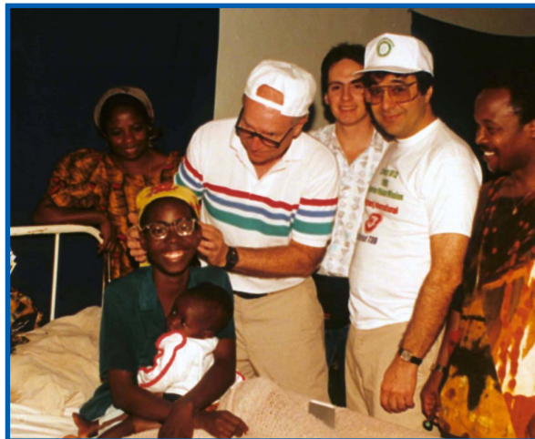
Nigeria - Nigerian mother with her baby following cataract surgery.