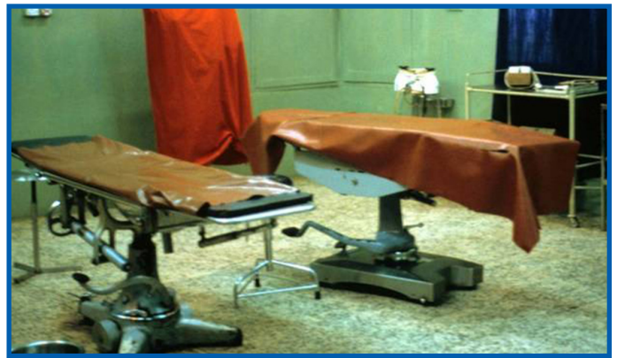
Nigeria - The sparsely and inadequately equipped operating room in the leading public hospital where surgery was performed.