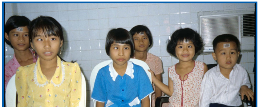
Vietnam - Vietnamese children with crossed eyes waiting for surgery.