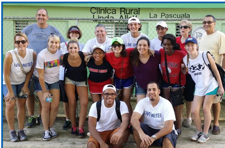
Dominican Republic - Above, Lebanon area high school students accompanying WBO team in January, 2015.