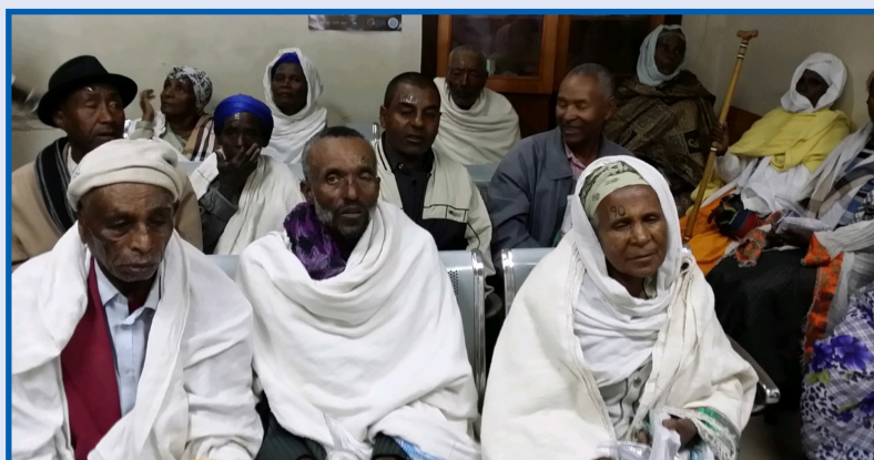
Ghana - Patients being evaluated for cataract surgery.