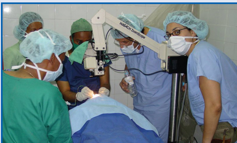
Ethiopia - Training Ethiopian doctor to perform small incision cataract surgery.