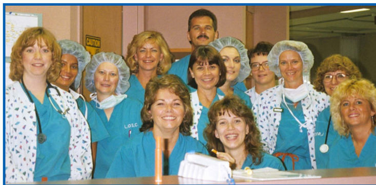
Mission Cataract: Lebanon Valley - Staff at Lebanon Outpatient Surgical Center where free surgery for uninsured and indigent patients was provided during Mission Cataract Week.