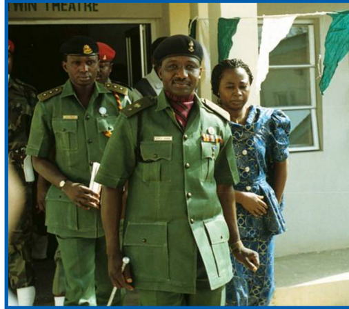
Nigeria 1990 – First World Blindness Outreach Mission. Governor of the state, General Coma, and the Minister of Health welcoming the World Blindness Outreach team and inspecting the facility at the beginning of the first mission in 1990.

We're blessed to be part of such a great team. You have our unending gratitude!